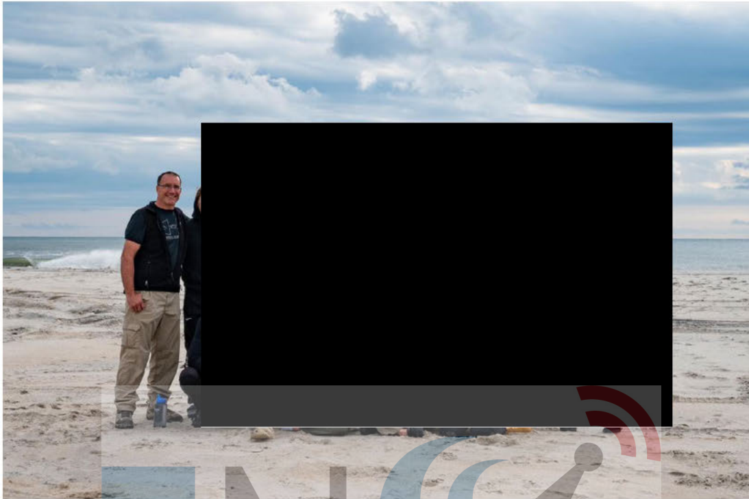
YSF Beach Trip 11-17-2022